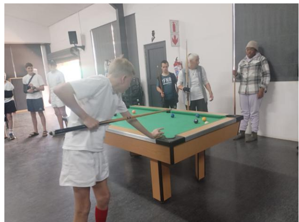
Some of our boys at enjoying some downtime with the Sunfield residents