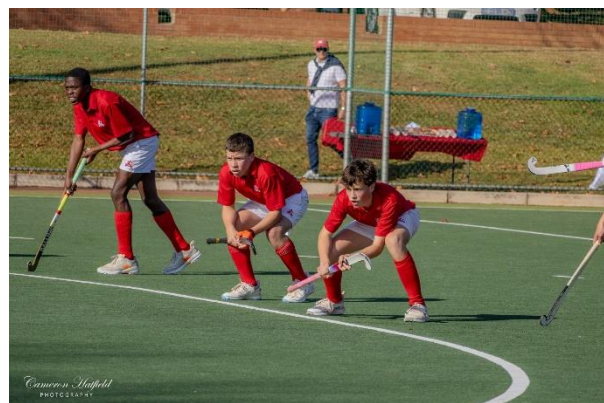
Snapshots of some of the hockey games played against Pretoria Boys