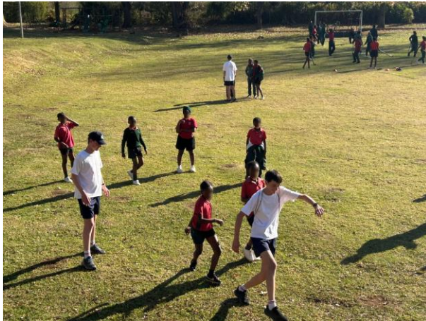
The boys visiting various MCPT partnership schools