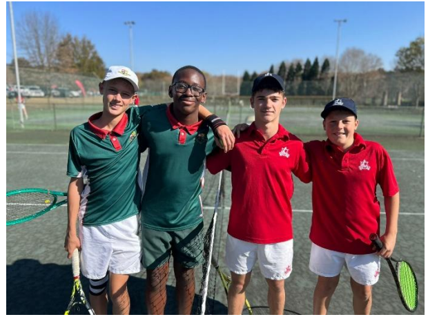
The Michaelhouse Tennis teams with their Pretoria Boys peers