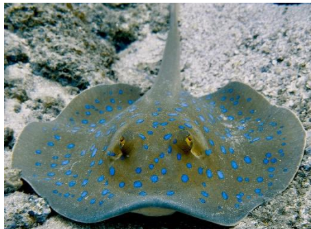
Snapshots of a successful weekend in Sodwana