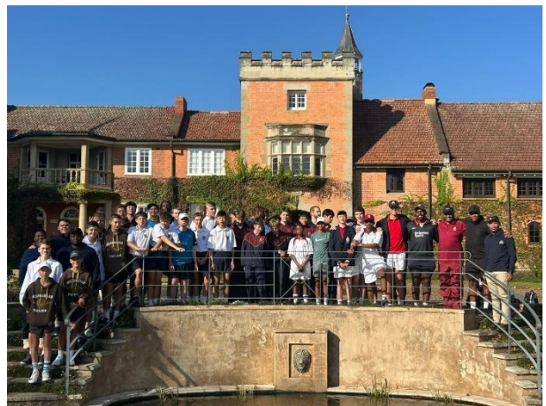
A successful festival, enjoyed by all