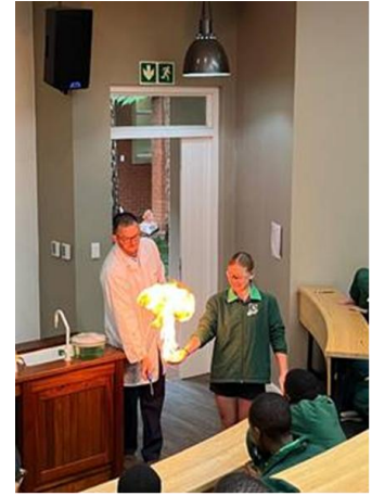
Howick Preparatory School Grade 7's enjoying the science demonstrations