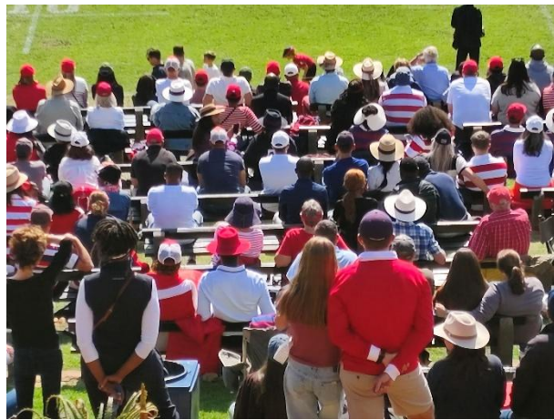
The St John's fixture well supported by our parents and Michaelhouse Community