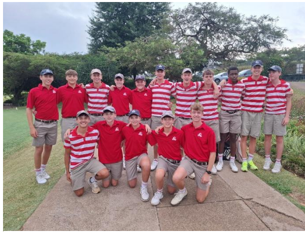
The 1 st and 2 nd golf teams at the MCG