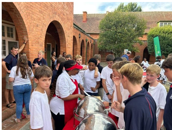
Busy scenes from the Society Fair's Culinary Society Table