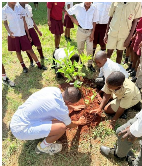
Baines boys help plant the indigenous trees at Jabula Combined School