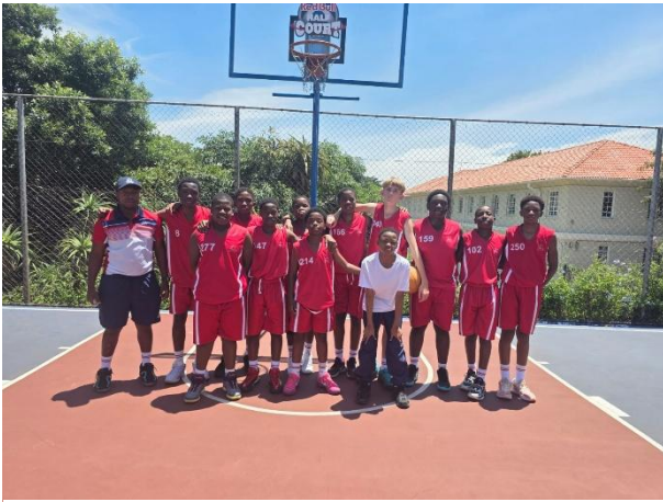
The U14A team after their 42 - 24 win against ESCA

Internal Michaelhouse games: U16C vs U15C won 48-11, U15E vs MHS U14D won 15-7