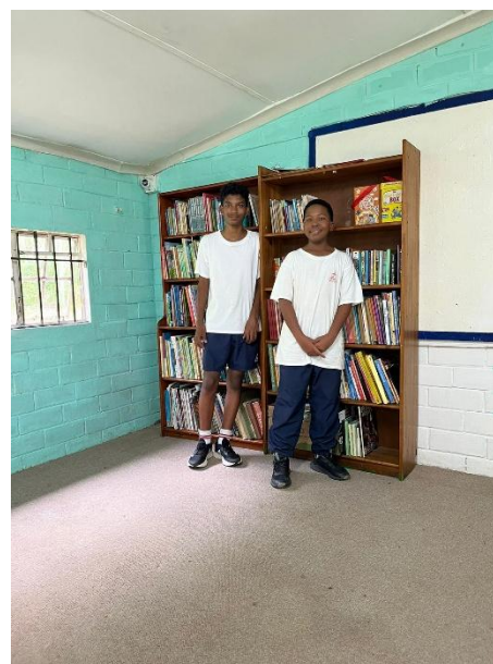
Mackenzie boys helping at Khazimula Childrens' Home