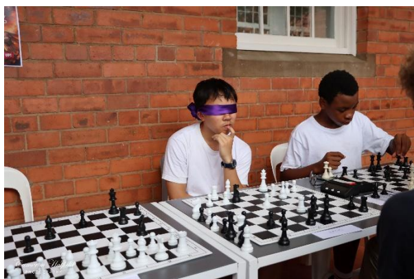
The various Clubs and Societies on display at the Societies Fair