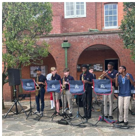
The Marimba Band (left) and Jazz Band (right) entertained the boys at the Societies Fair