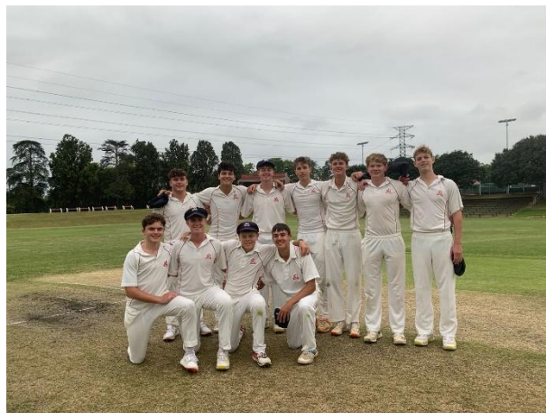
The 2 nd (left) and 3 rd (right) XI after their victories against College

The U16 age group dominated the weekend fixture by securing victories by all three sides. The U16A bowled College out for 73 in 30.5 overs before chasing down the target comfortably at 74/2 in just 14.3 overs for an 8-wicket win. The U16B restricted College to 93/8 in their T20 match before racing to victory at 94/3 in just 8 overs, winning by 7 wickets. The U16C successfully defended 117/9, bowling College out for 81 in 13.1 overs to win by 36 runs and complete the age group clean sweep.