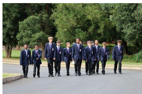
2026 E Block boys walking up Warriors Walk (above) and in the Chapel during the Induction Ceremony (below)