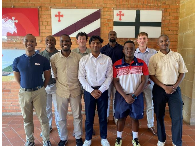
New Interns in 2026