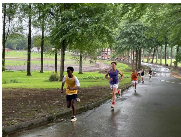
Boys running the Quarters Relay