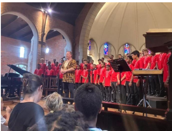
Michaelhouse Chapel and Chamber Choirs sang as a prelude to the Drakensberg Boys Choir