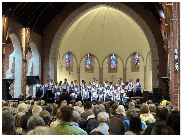
The Drakensberg Boys Choir performing on Sunday in our Chapel