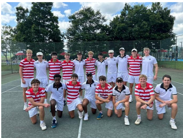
Both tennis teams at the De Wet Cup