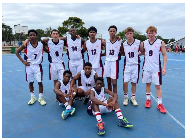
The 2 nd basketball team after their narrow loss (25-30) against Northwood