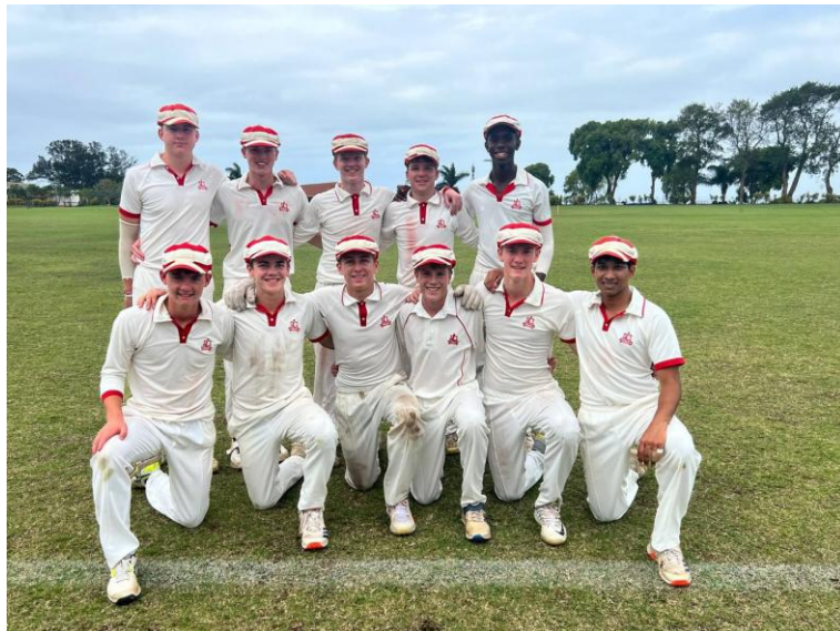
1 st XI after their narrow loss to Northwood

Inter-House cricket took place this week with the following results: