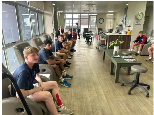
1 st XI during their visit to Hopelands Cancer Centre