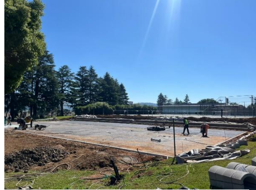
Construction on the new basketball courts – an exciting step towards improved facilities for our players