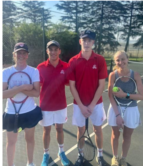
Some of the players at the Clark Cup