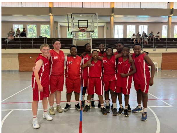
The U14E team showed great determination to win 13-12 in extra time