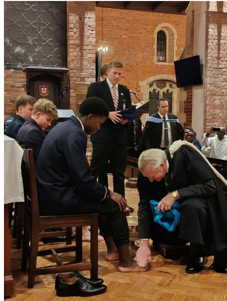
Scenes from the Induction Service and the Washing of the Feet Ceremony

Congratulations to the following boys who have been selected as House Prefects: