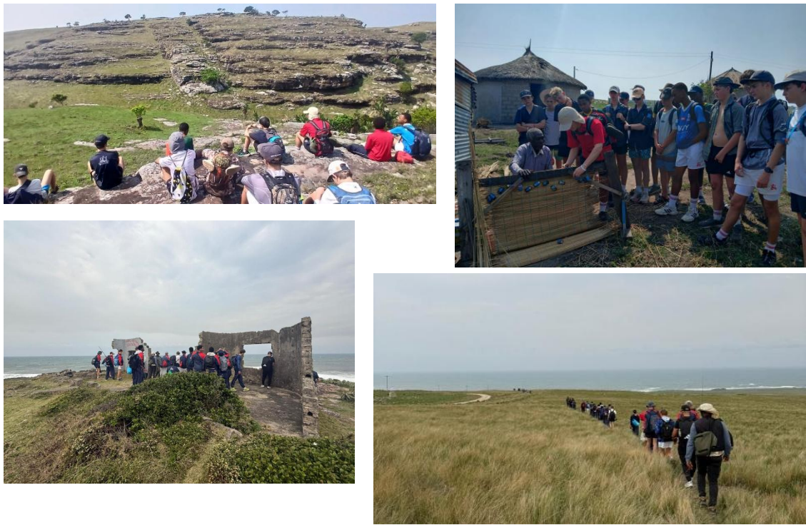
Snippets from the D Block Pondoland journey (above) and the C Block Journey (below)

In the meantime, your sons will shortly be on their way to you at home and I wish you a wonderful two weeks re-connecting with them and hearing many stories about the past term – and especially their outdoor education experiences.