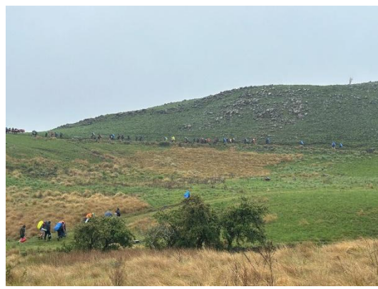
E Block adventures this morning in the cold frosty hills behind Michaelhouse