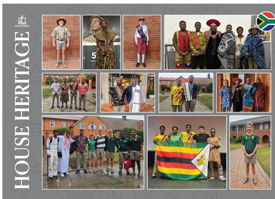
What the boys wore on the Friday of the Cultural Week

Perhaps one of his greatest achievements is his significant contribution to the recording of the process of South Africa's democratic change. In 2003 he was commissioned to archive and document the life and times of Nelson Mandela for the Nelson Mandela Foundation. Over the years this afforded him many intimate experiences with a man who he feels embodies the very spirit and conviction we all possess as South Africans in the world today.