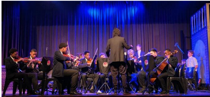
The Michaelhouse Jazz Band performing at Maritzburg College

It was an excellent celebration of music, brotherhood, and community.