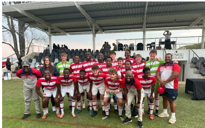
Michaelhouse 1 st Soccer Team lifting the Jody Momphe Cup