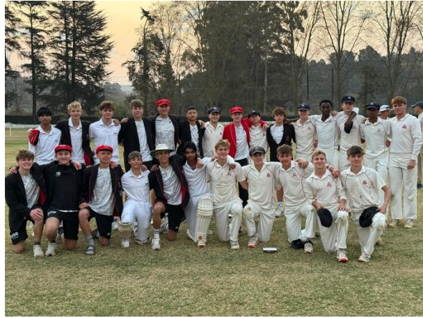
The U17 Stayers team with Steyn City 1 st XI