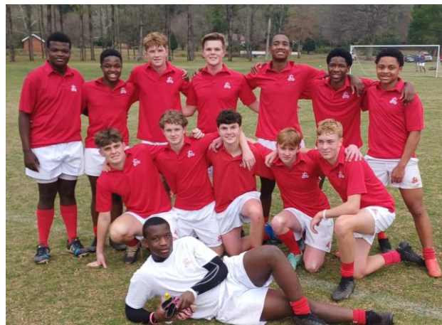
4 th Soccer Team after their 3-1 win against Hilton