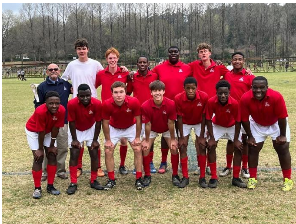
5 th Soccer Team after their 4-0 win against Hilton

U16A lost 1-4, U16B drew 2-2, U16C lost 0-2 and U16D won 4-3 U15A lost 2-4, U15B drew 0-0, U15C won 3-0 and U15D won 3-2 U14A won 3-1, U14B lost 2-3, U14C lost 0-2, U14D drew 2-2 and U14E won 2-1