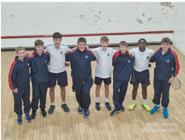
2 nd squash team with the St John's squash players

At the festival, our boys played hard, with many matches going right down to the wire. Although we had a few very close calls, we didn't always get the final result they we were hoping for. Overall, it was a successful tour that provided invaluable experience for our players. Congratulations to all of the boys on their dedication and effort!