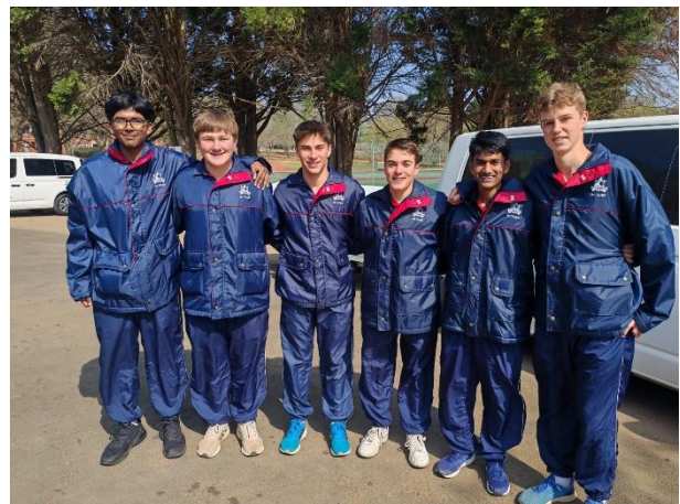
1 st squash team ready for their games