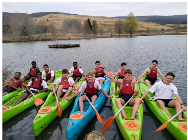
E Block in their canoes at van der Westhuyzen Dam