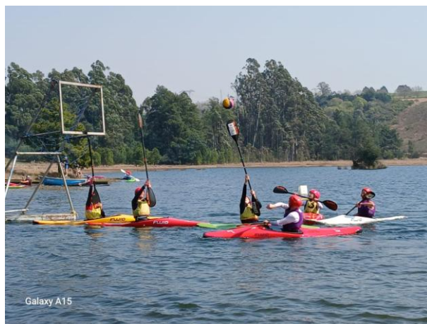
The Michaelhouse Canoe Polo team before a game (left) and in action (right)