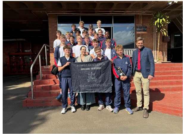
Future-Fit class of 2025 at Celrose textile company