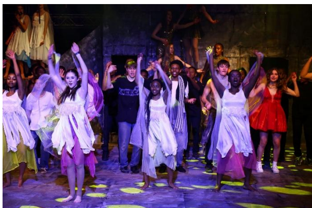
Scenes from the Jesus Christ Superstar production