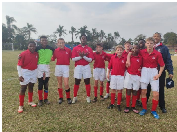
U14B soccer team after their 3-all draw against Westville

2 nd team lost 0-1, 3 rd team lost 0-1, 4 th team won 3-1, 5 th team won 5-1, 6 th team won 2-1 and 7 th team won 2-1