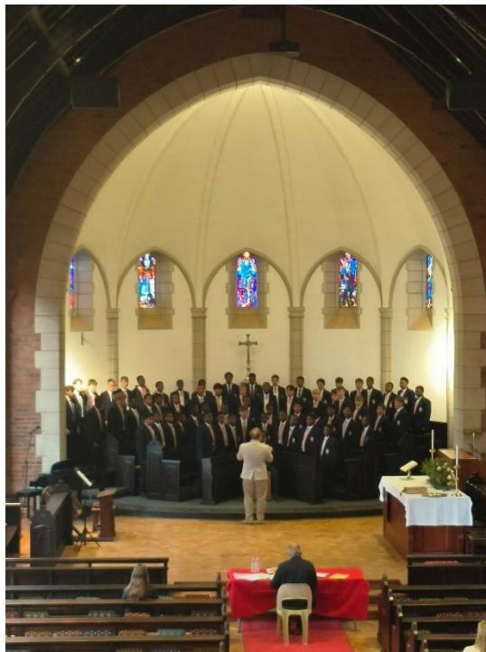
The Chapel Choir performing for the National Eisteddfod