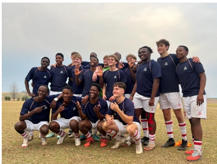
1st Team Soccer after their 8-0 win over Clifton College