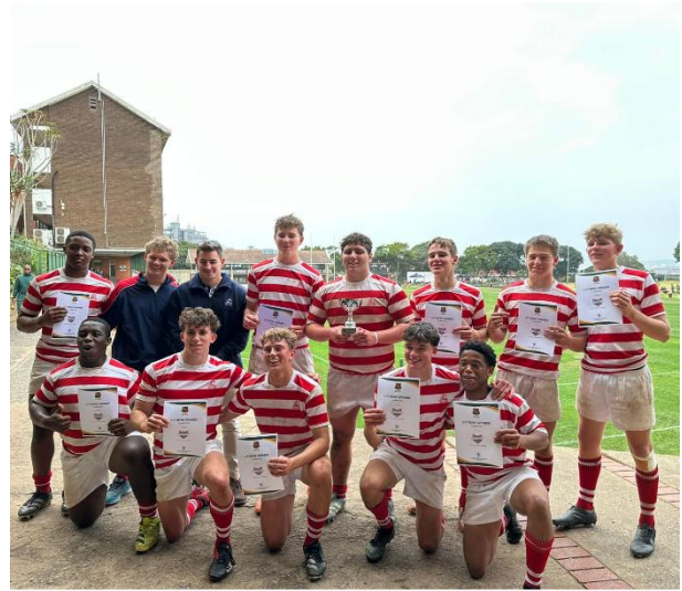
The 2 nd team - winners of the Bowl final