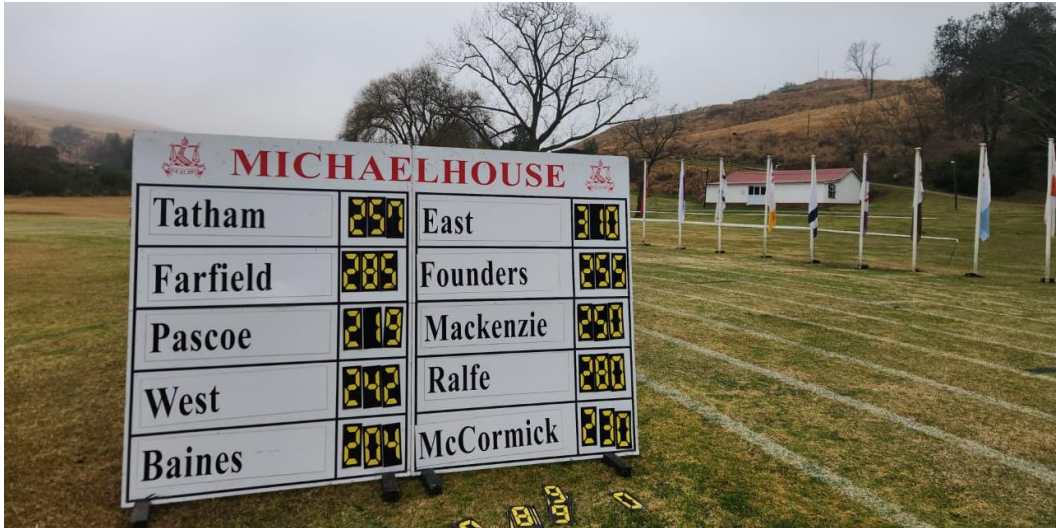
Inter-House Athletics scoreboard as of Tuesday afternoon, with East currently in the lead

Some parents will be able to be present at the Inter-House Athletics this afternoon. We have already had several relays and other events in our expanded athletics programme and, during yesterday afternoon, the points stood on the board as below: