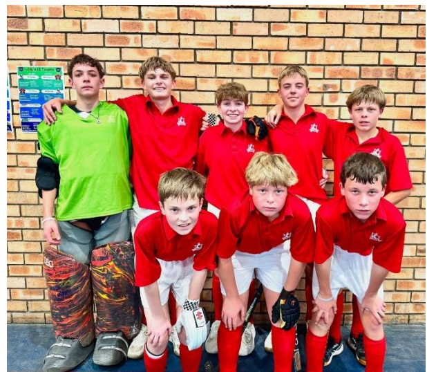
U16 Indoor Hockey Team