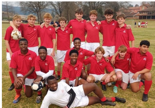
7 th soccer team after their 2-1 win against Westville

The Michaelhouse First Team took to the Big 10 Tournament with grit, flair, and determination, producing a series of remarkable performances and leaving their mark on the competition.