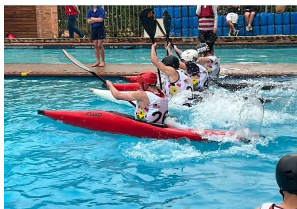
U14 (left) and U16 (right) final races