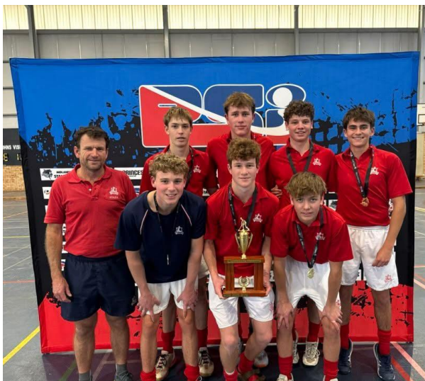
Tournament winners – U18 Indoor Hockey Team

Congratulations to all our boys for their hard work, resilience, and excellent sportsmanship.