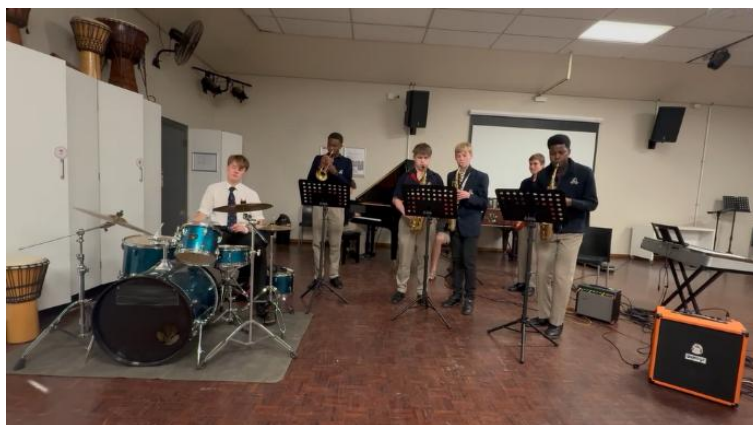
The Jazz Band practising for the final at Stellenbosch University

On 31 July the Michaelhouse Jazz Band participated in the first round of the renowned Stellenbosch National Ensemble Competition, founded in 1995. We are delighted to announce that our Jazz Band has been selected as one of only three schools in South Africa to progress to the finals. The finals will take place on 27 September at the esteemed Endler Hall at Stellenbosch University. We extend our warmest congratulations and best wishes to the Jazz Band as they proudly represent Michaelhouse on the national stage.