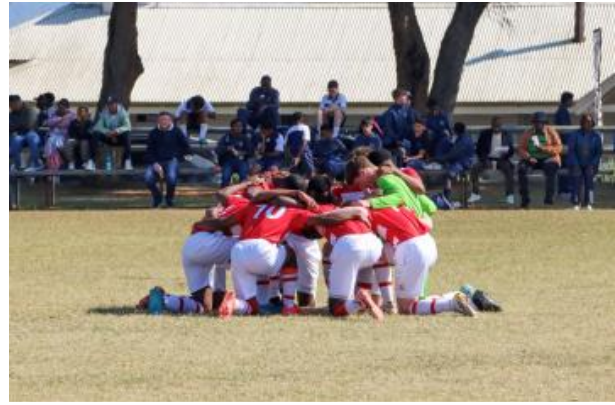
The Michaelhouse 1 st Team locks in as one before kick-off — united in purpose, focused, and ready to give their all on the field

Congratulations for the following boys who have been selected to represent the Midlands District Soccer Squad: