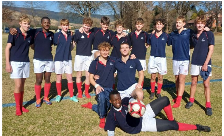
The 7 th soccer team after their game against the 8 th soccer team