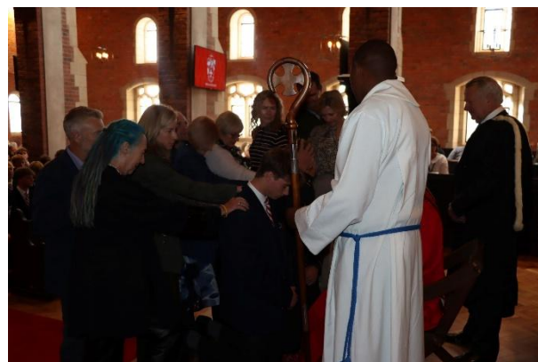
Some of the 83 B Block boys being confirmed