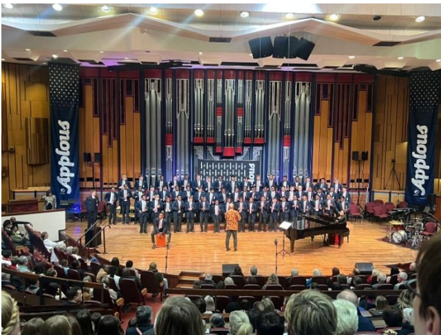
The Chapel Choir on stage

The Chapel and Chamber Choirs now look ahead to their next engagement: the National Eisteddfod later this month.