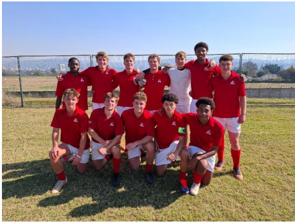
The 4 th soccer team after their 6-2 win over St Charles

1 st team drew 0-0, 2 nd team won 1-0, 3 rd team won 6-0, 4 th team won 6-2, 5 th vs Michaelhouse 6 th team drew 0-0, 6 th vs Michaelhouse 5 th team drew 0-0 and 8 th vs Michaelhouse 7 th team lost 0-5