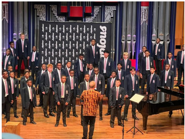
Success in Pretoria