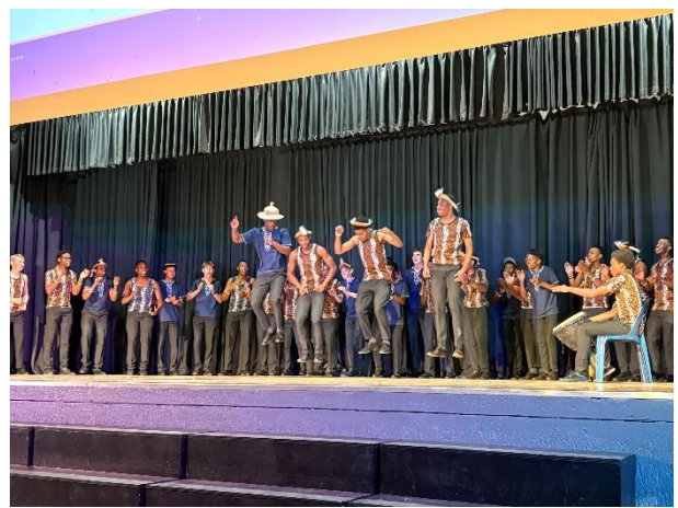
The C Block Zulu classes entertaining the audience