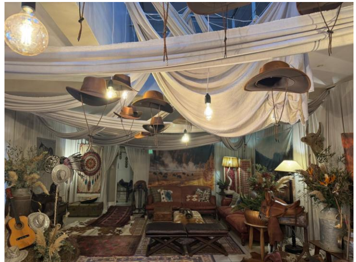
The Indoor Centre totally and magically transformed