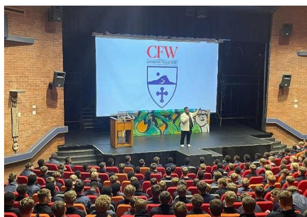
Scenes from the various activities during Christian Focus Week