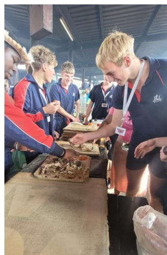
Eating inyama yenhloko in the Bovine Head Market