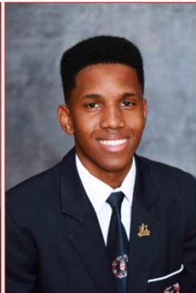
Lerotholi Seeiso Deputy Governor