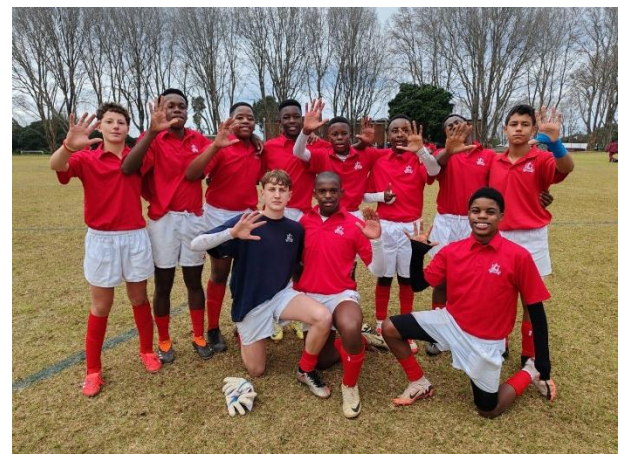
U14A (left) and U14B (right) soccer teams after their victories over Kearsney