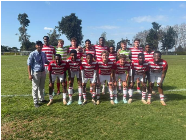
2 nd soccer team after their 4-0 win

U14A won 5-2, U14B won 1-0, U14C won 2-1, U14D lost 0-1, U14E lost 1-5, U14F lost 0-4 and U14G drew 0-0