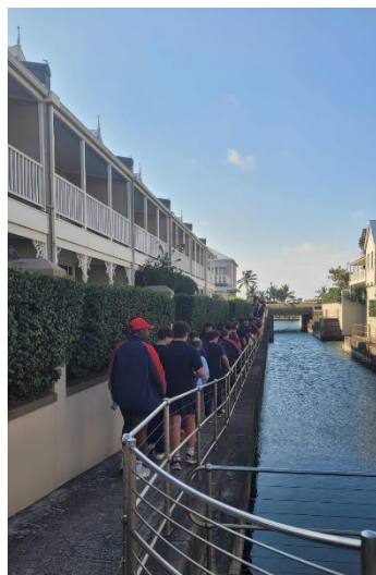
Walking along the canals of the restored Victorian buildings

Outdoor learning of this nature truly brings the curriculum to life—transforming theoretical content into lived experience and embedding these concepts more deeply in students' understanding and memory.