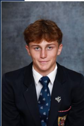
Reily Elliot Governor