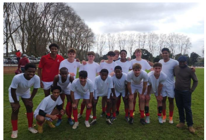
3 rd soccer team after their 2-1 win