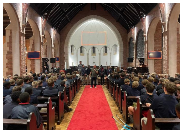
Various activities during CFW