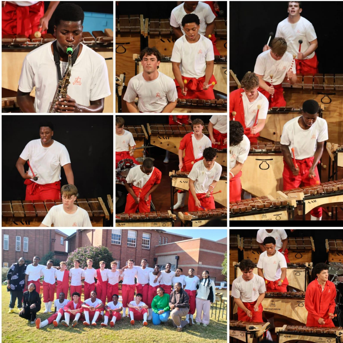
The Michaelhouse Marimba Band in action

We are incredibly proud of our marimba musicians and look forward to following their upcoming performances.