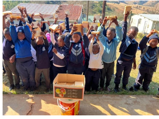
The making of the soup and the outcome