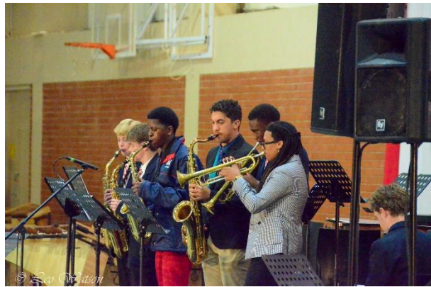
The Chapel Choir (left) and Jazz Band (right) performing at the Two Schools in Concert