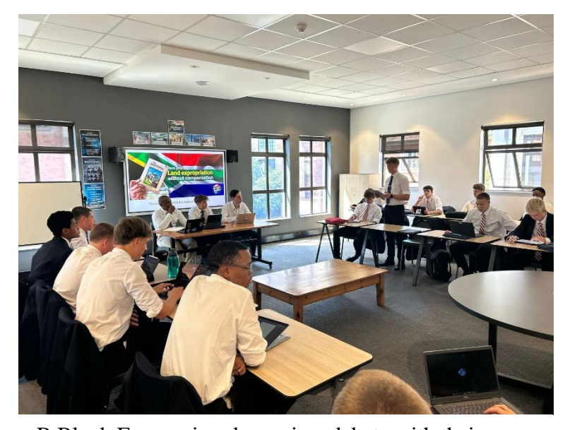
B Block Economics classes in a debate with their peers

These debates, part of the Economic Systems module, continue to ensure the boys engage with contemporary issues which may shape the country's future.