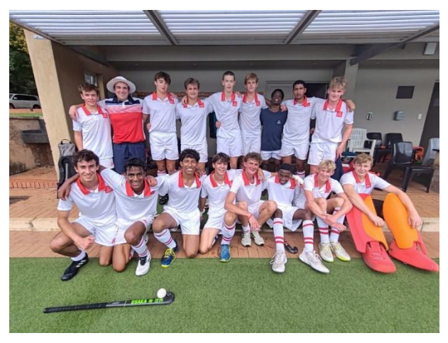
2<sup>nd</sup> XI hockey team