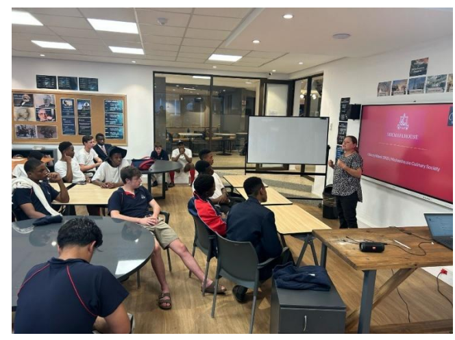
Nova from N<sup>2</sup> Bakery teaching the Culinary Society

The session highlighted the significance of using fresh ingredients and explored some other important aspects of baking with which the boys may have been unfamiliar with the role of wild yeast and bacteria in making healthy sourdough.