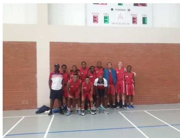
The U15A team after their hard-fought 32-29 victory