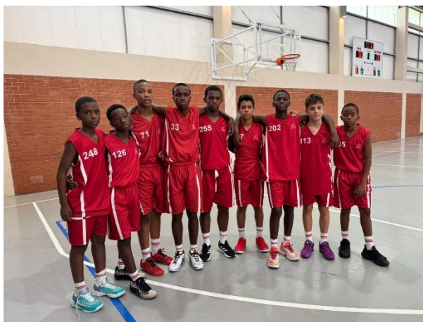
The U14A team after their impressive performance in their 33-20 victory over St Charles – their first in Michaelhouse colours!