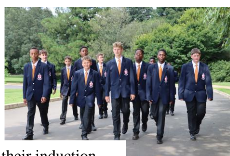
E Block boys walking up from the Main Gate to their induction