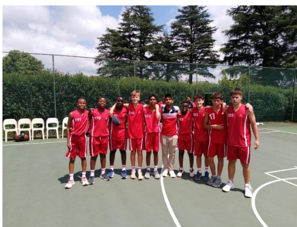
The U15D team after their comfortable 24-7 victory

We hosted our annual U16 Festival on Sunday, with both our A and B teams taking part. The U16Bs had a good festival ending 6 th out of 10 whilst the A team went unbeaten and lifted the trophy at the end of the day - well done.