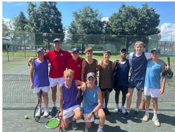
Junior Inter House Tennis Tournament