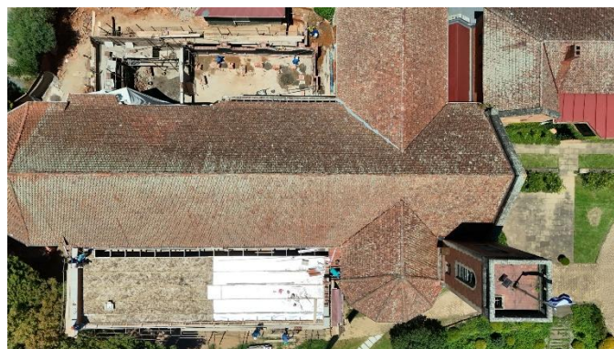
Photographs taken from a drone, showing the progress of the Chapel extension