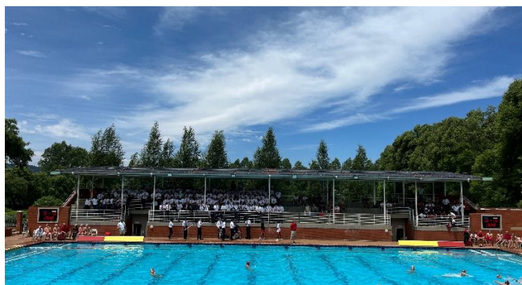
1st Team in action vs Maritzburg College – clear skies and a stand with Michaelhouse supporters

U14B lost 4-7, U14A won 7-2, U15B won 11-2, U15A lost 2-3, 3rds drew 7-7, 2nds lost 4-8 and 1sts drew 9-9.