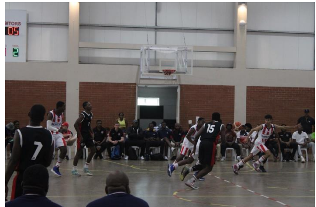
The 1 st Basketball team in action against Maritzburg College