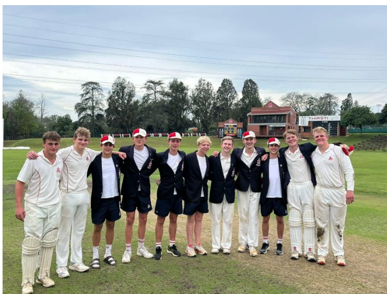
2 nd XI after their win against College, having chased down 250