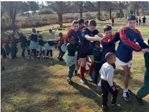
West House continues to assist with the Foundation Phase Aftercare programme at Nottingham Road Primary School

There are approximately four or five visits per week where boys from different Houses visit their respective CPT partner schools to assist with various tasks and activities identified by the principals of the schools. The boys may facilitate rugby skills, homework, reading activities, or enjoy a game of soccer.