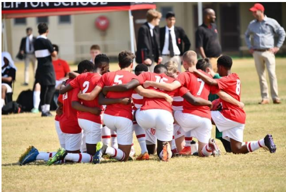
A 1 st team huddle celebrating their 3-1 win

We also hosted our friends from Zenzani Village again and competitive football was played, and stronger bonds forged on and off the field.