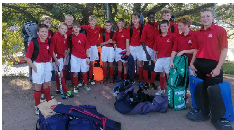
The U14A hockey team after the win against Westville Boys' High School

1 st team drew 1-1, 2 nd team lost 0-3, 3 rd team drew 3-3 and 4 th team lost 1-3.