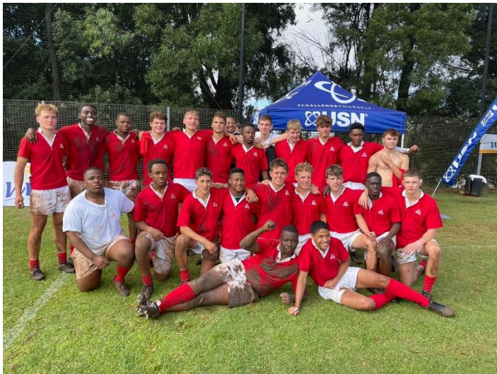
U16A rugby team at the Jeppe Festival in Johannesburg

The U16A team went to the Jeppe Festival in Johannesburg and also did well, winning two games and losing one: vs Grey PE won 19-17, vs Jeppe lost 13-17 and vs St Andrew's won 5-0.