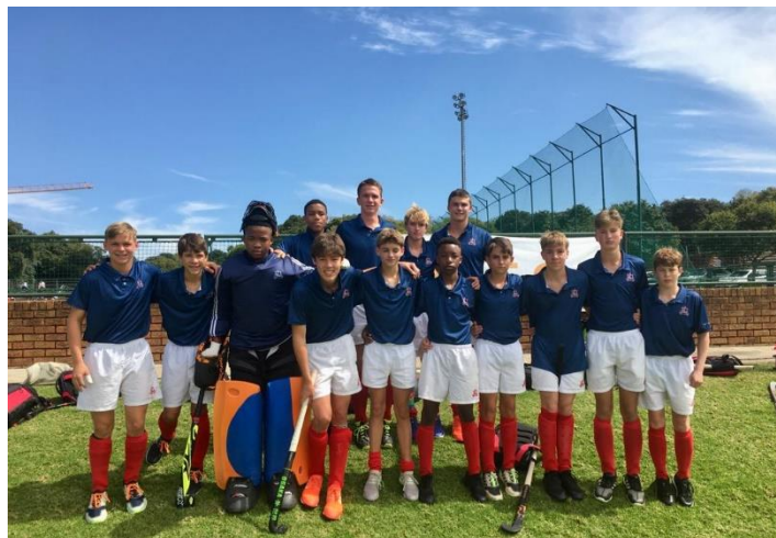
U16A hockey at the ISHF at St Alban's

The U16A team played at St Alban's in Pretoria as well as at Pretoria Boys' High School, playing 6 games, winning 5 and losing 1 with the following results: vs Bishops lost 0-1, vs St Benedict's won 5-0, vs Cornwall Hill won 4-0, vs St David's won 5-0, vs Helpmekaar won 3-0 and vs St Andrew's won 5-0.