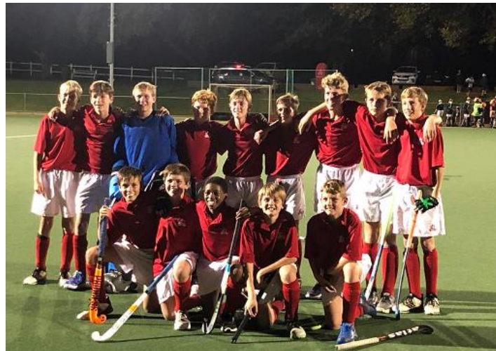
U14A hockey team played at home in the ISHF

There were several festivals over the holiday period, both at Michaelhouse and away. The U14A team played in the ISHF at home and achieved the following results: vs Cornwall won 5-0, vs St Benedict's drew 3-3, vs Bishops drew 3-3, vs St Andrew's Bloemfontein won 8-0, vs St David's won 3-0 and vs St Andrew's lost 1-2.