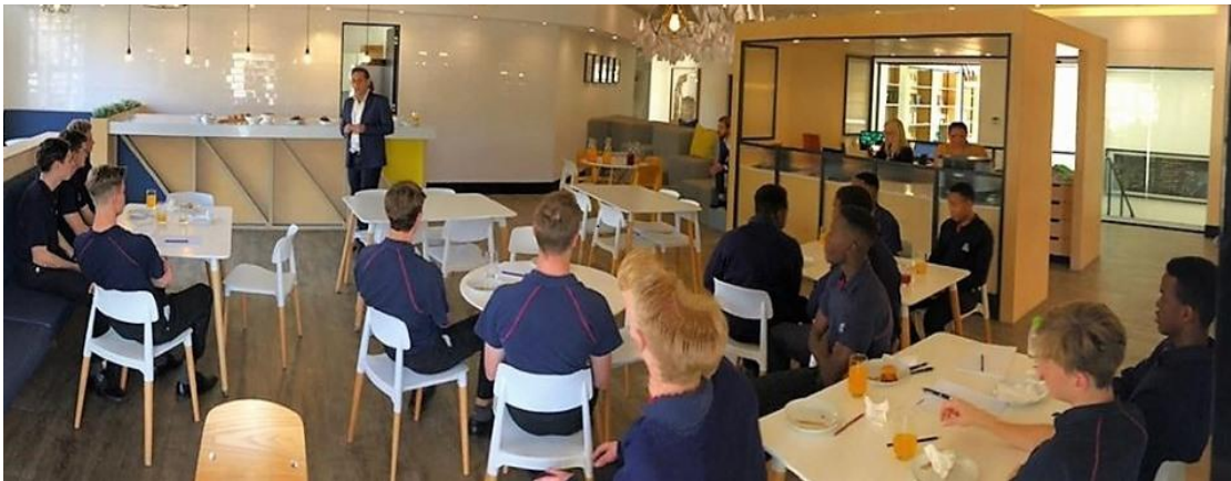
B Block Accounting pupils on tour in Johannesburg visiting a business

Last week our B Block Accounting pupils went on tour to Johannesburg where they visited a number of companies and businesses and gained some insight into a variety of corporate issues such as how value can be added and profit yields. They visited Deloitte, Alpha Wealth, Standard Bank, Karan Beef (feedlot, abattoir and processing plant) and Sesisonke Farming. It was a most beneficial learning experience for our boys.